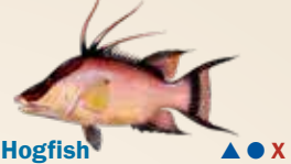
Hogfish ▲ ● X

Atlantic regulations apply to Monroe county. Includes all waters south of Cape Sable.